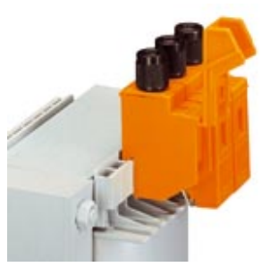
The illustration shows versions TRKS 4-SI and TRKS 4/1-SI in orange

Transformer terminal block, Connection method: Screw connection, Length: 45.8 mm, Width: 12.5 mm,